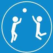
CHILDRENS PLAY AREA