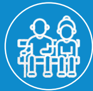
SENIOR CITIZEN CORNER