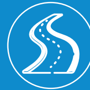
CONCRETE PAVER ROADS