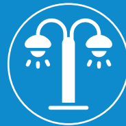
LED STREET LIGHT